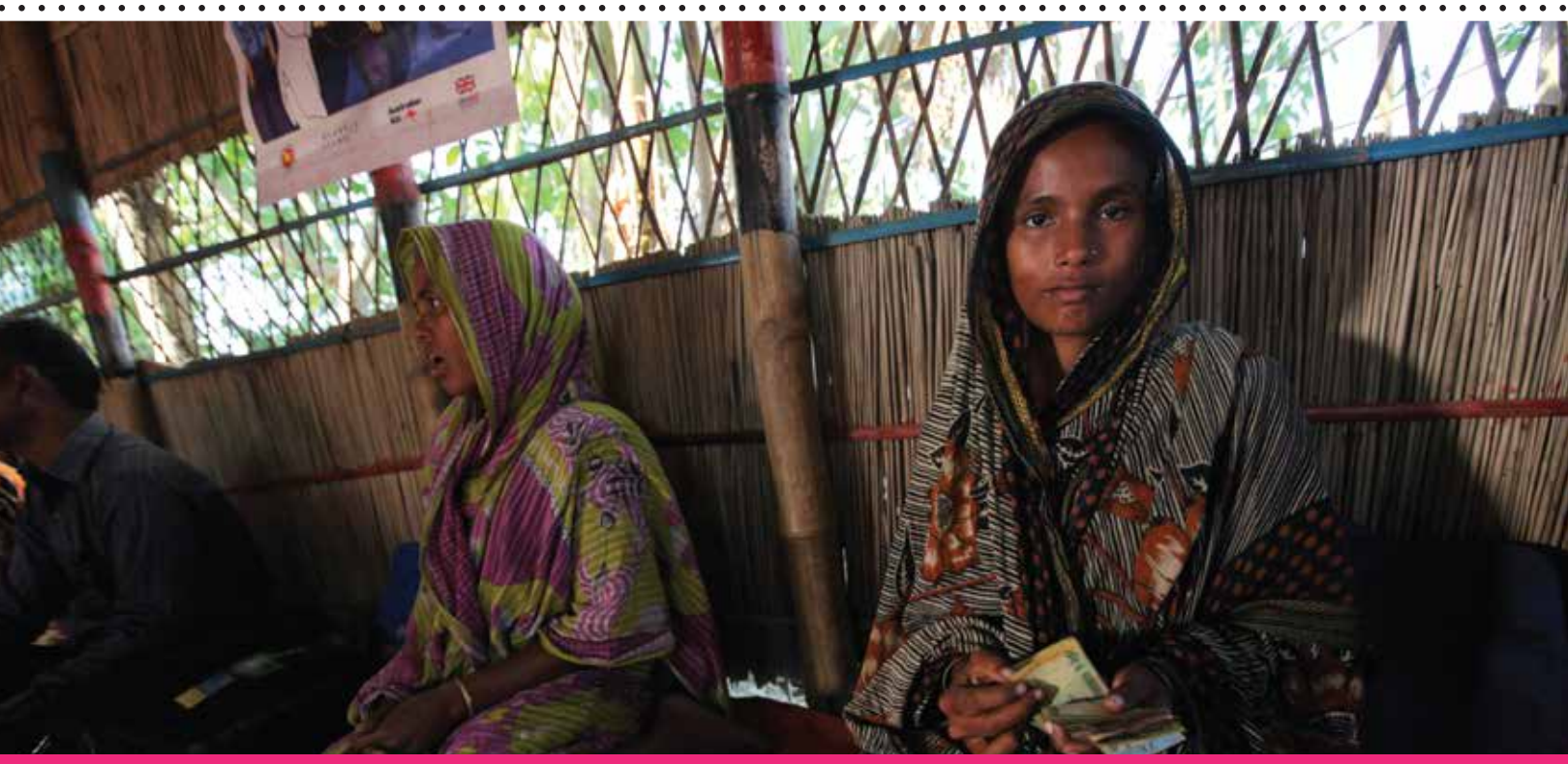
CLP'S EXPERIENCE IN MEASURING WOMEN'S EMPOWERMENT

This brief does not intend to replicate information already contained on the CLP website (www.clp-bangaldesh.org) which explains in detail how CLP developed an innovative approach to tracking women's empowerment along with the key findings. Instead, this brief focuses on key lessons learnt from developing and applying the approach.