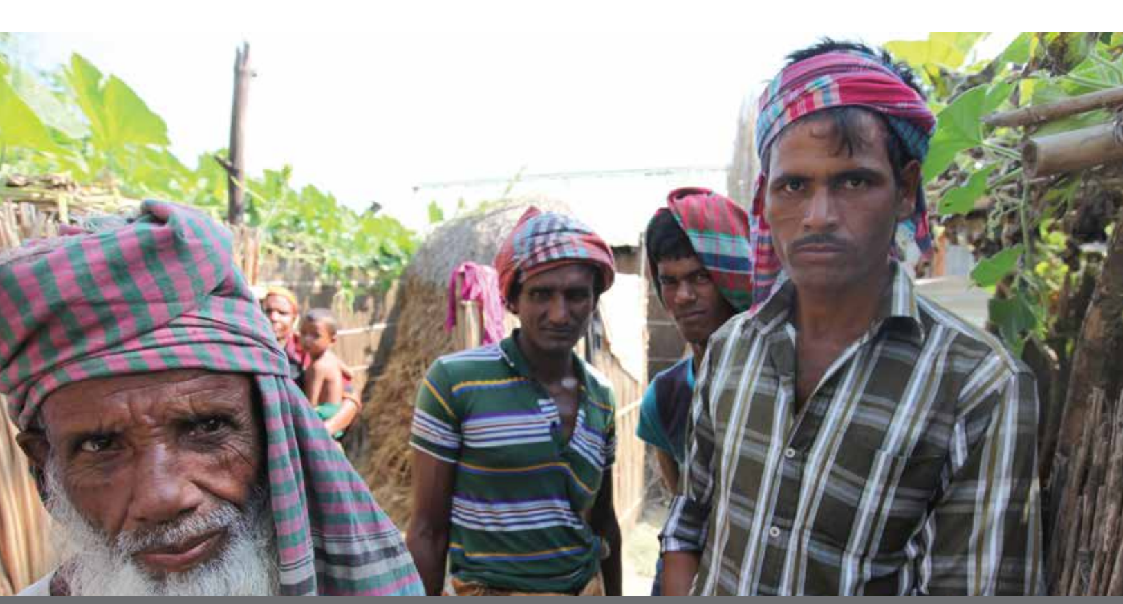
CLP'S EXPERIENCE IN FORGING PARTNERSHIPS

For the education sector in particular, time-bound programmes such as CLP are not an effective way to provide education services, which must be long-term. CLP did not have a specific partnerships strategy focusing solely on education. Developing one might have helped CLP to work more closely with various education stakeholders (government, NGOs, donors) in a more coherent fashion, thus driving greater impact. However, planners and implementers should always bear in mind whether it is desirable or feasible to have a livelihoods-focused programme such as CLP becoming involved in sectors such as education.